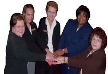
"Helping hands lighten the load"