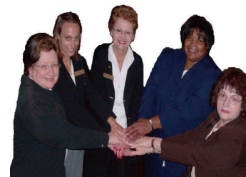
"Helping hands lighten the load"